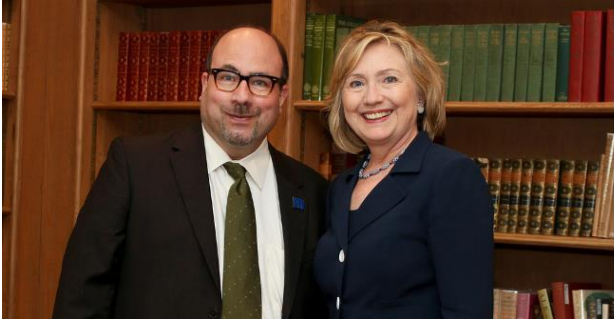
(probably 2013) Craig Newmark is on the left 5 .